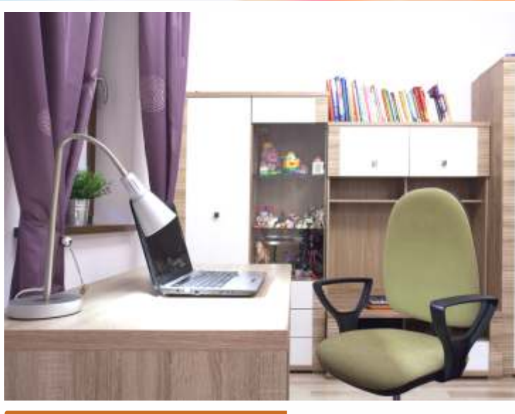
Guest Room with attached Terrace